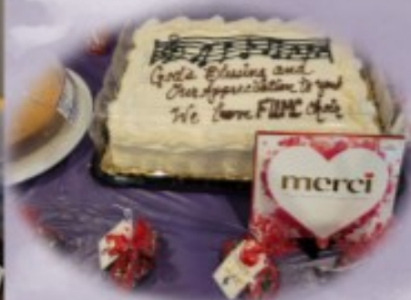
Choir Appreciation Sunday